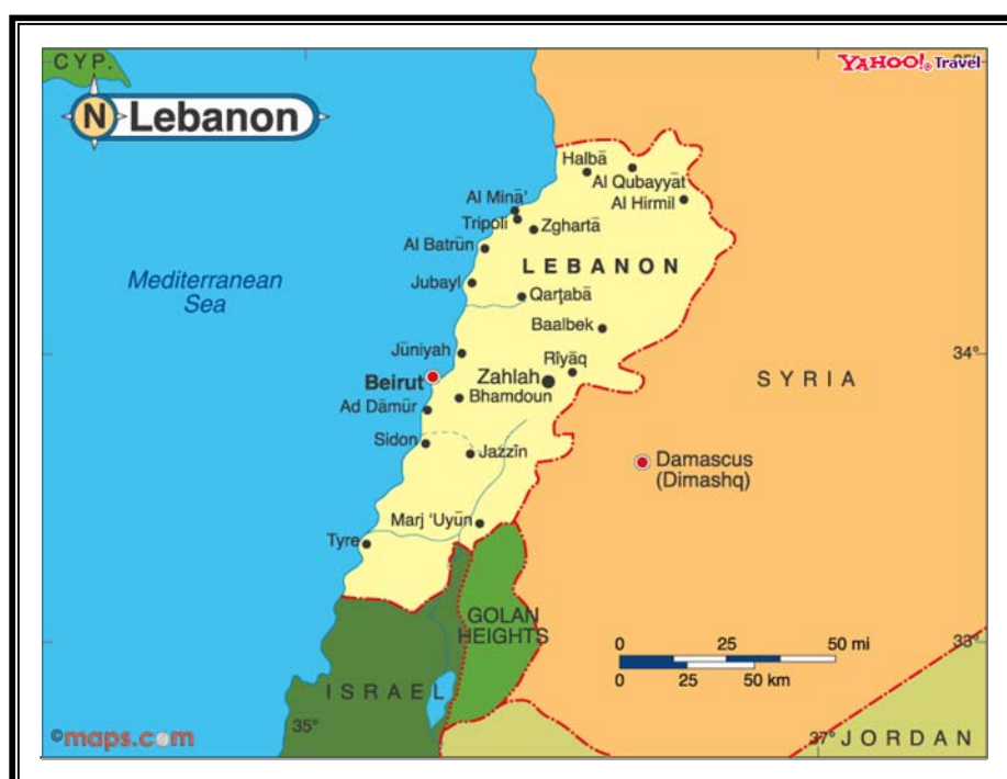
Map of Lebanon

Lebanon is a small country of only 10,452 sq km, from north to south it extends 217 km and from east to west it spans 80 km at its widest point. The country is bounded by Syria on both the north and east and by Israel (the Palestinian Occupied territories) on the south. Lebanon's landforms fall into four parallel belts that run from northeast to southwest: a narrow coastal plain along the Mediterranean shore. Most of Lebanon has a Mediterranean climate, with warm, dry summers, and cool, wet winters, although the climate varies somewhat across the landform belts. The coastal plain is subtropical, with 900 mm (35 in) of annual rainfall and a mean temperature in Beirut of 27° C (80° F) in summer and 14° C (57° F) in winter.