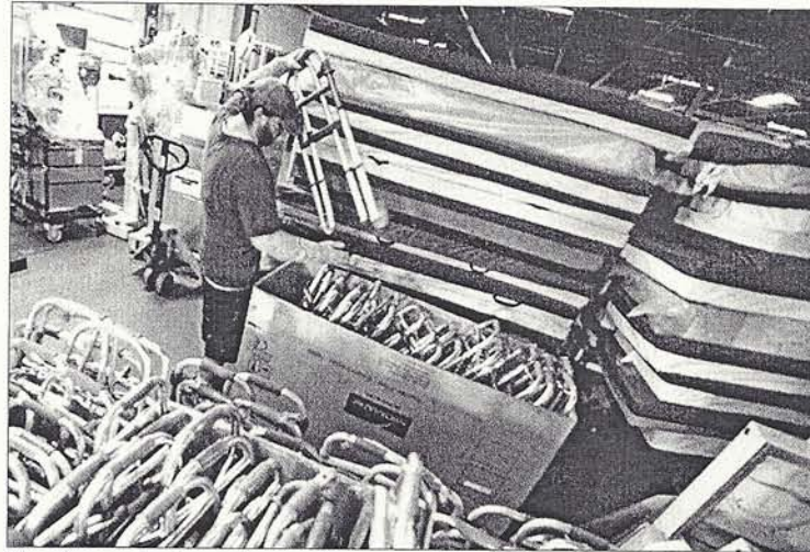
Surplus medical supplies, equipment and furnishings are collected, prepared and stored in Global Links' 23,000 square foot warehouse in Pittsburgh, PA before being sent to hospitals throughout Latin America.