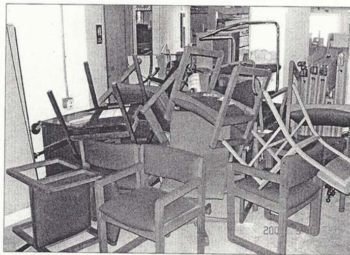
These are furnishings from Baystate Health System in Springfield, MA. This was a multiple container project. The surplus comprised most of the furnishings and equipment from a building that’s being demolished in advance of new construction.

Garcia and Hower emphasize that items of low-dollar value can make a huge difference where there is little – or nothing to be had.